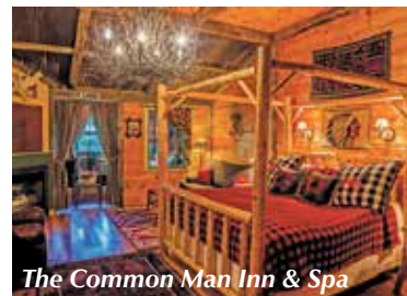
The Common Man Inn & Spa