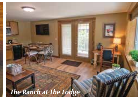
The Ranch at The Lodge