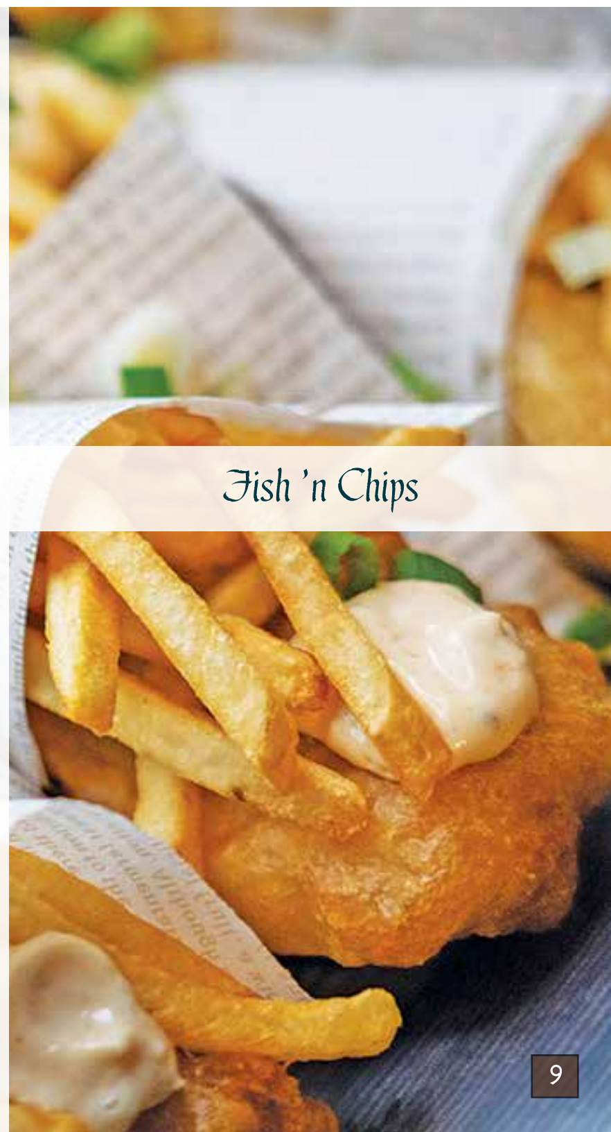
Fish 'n Chips

Consuming raw or undercooked meats, poultry, seafood, shellfish or eggs may increase the risk of foodborne illness, especially if you have certain medical conditions.