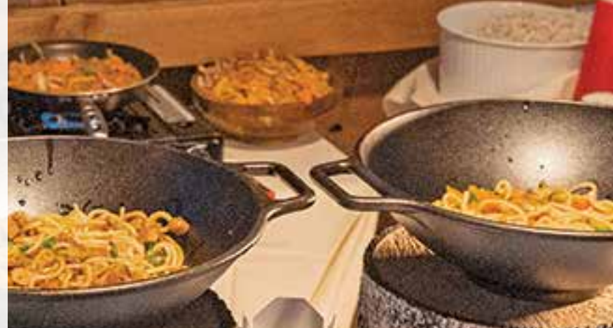
Udon Noodle Bar

The Barn's Grilled Cheese Station 12. per guest. Brie and Apple Mozzarella, Tomato, and Pesto Caprese Bacon, Cheddar, and Caramelized Onion