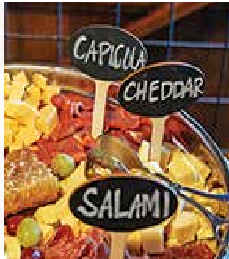
Charcuterie & Cheese

Consuming raw or undercooked meats, poultry, seafood, shellfish or eggs may increase the risk of foodborne illness, especially if you have certain medical conditions.